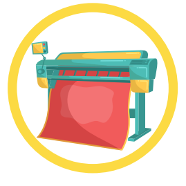
A Qualitative Printing